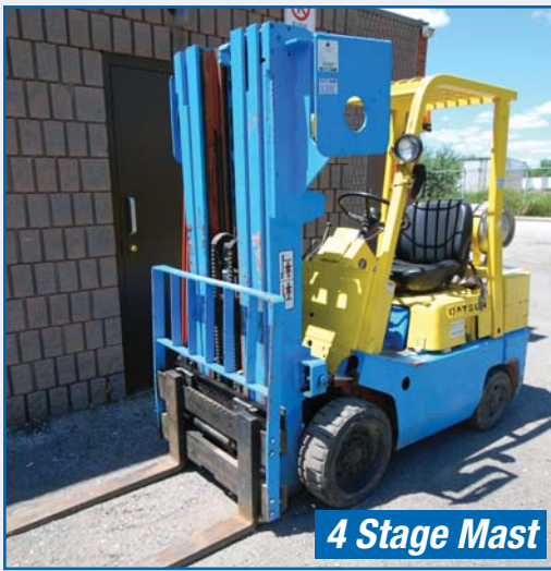
4 Stage Mast