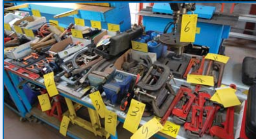
View of Hand Tools