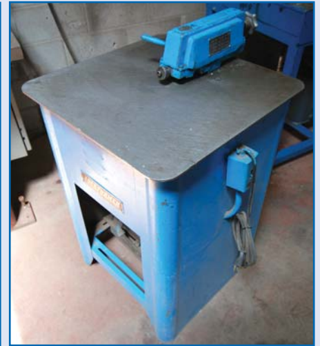
LOCKFORMER Model 16 Power Flanger, 16 Gauge, sn 1527