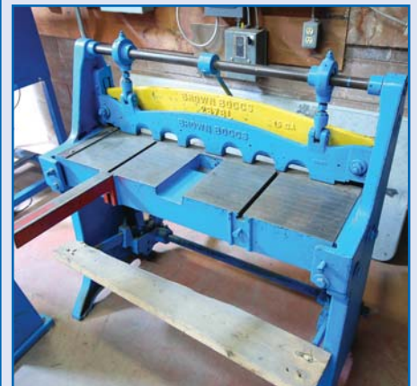
BROWN BOGGS Model 237 BL 36" x 16 Gauge Foot Shear