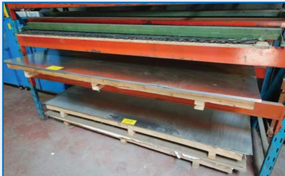
View of Raw Material