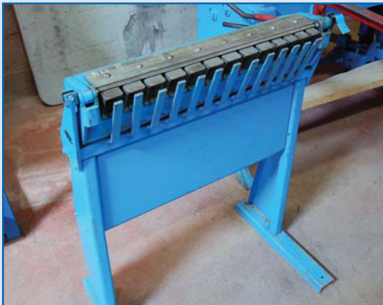
BROWN BOGGS 24" Cleat Bender