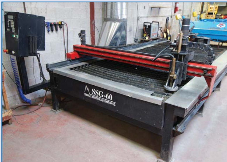
PINNACLE INDUSTRIAL AUTOMATION 5'x12' Plasma Cutting Table