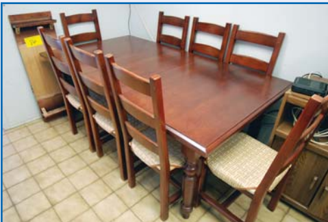
44"x64" Wood Dining Table Plus (2) 15" Leaves