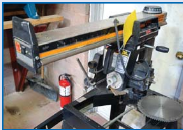
RYOBI, Model RA 2500 Radial Saw