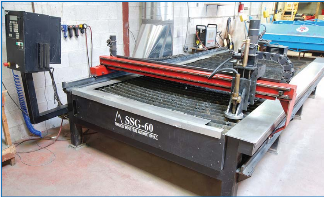
PINNACLE INDUSTRIAL AUTOMATION 5'x12' Plasma Cutting Table, Model SSG-60, Single Head, Hypertherm Powermax 900 Power Source, Lynx Control, PC