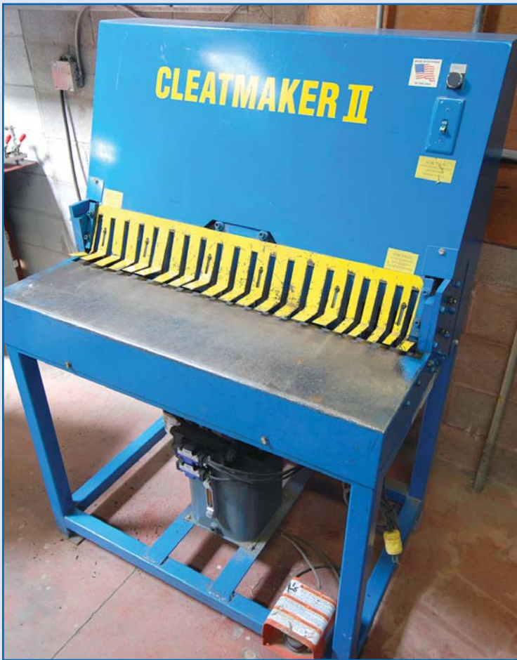
CLEATMAKER II, 36" Powered Cleatbender