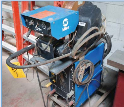
MILLER Regency 200 Welder