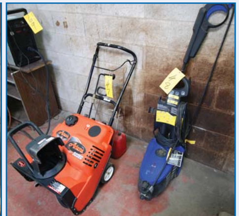
View of Snow Blower & Power Washer