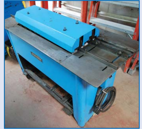
LOCKFORMER Model 22 Quad Rollformer, 22 Gauge Capacity, Fish lock, Flat S, Drive Cleat, 5 HP, 550V, sn 8097