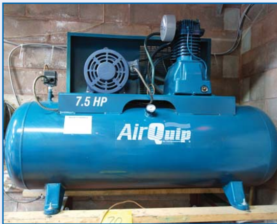
AIR QUIP 7.5 HP Air Compressor