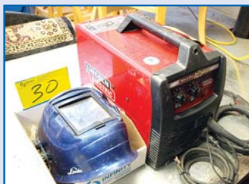
LINCOLN ELECTRIC Weld Pack 125 HD