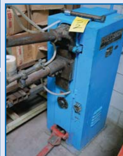
PRECISION Spot Welder, 20 KVA