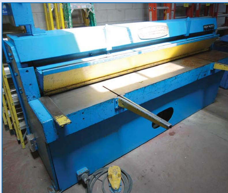
EDWARDS 8' x 1/8" Power Shear