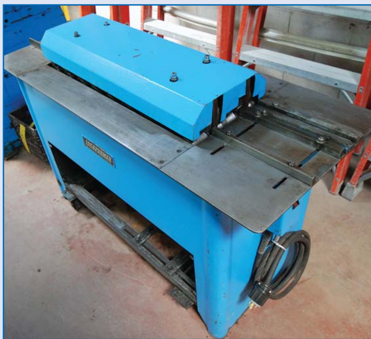
LOCKFORMER Model 22 Quad Rollformer

Auction: Wednesday September 9, 11:00 am (ET)